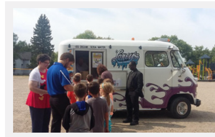
2nd Graders lining up for treats

Since 1976 FACE has given over $2 million dollars in tuition assistance to St. John's Academy. The "100 by 40" capital campaign came to a successful conclusion this year. Thanks to the generosity of its supporters, FACE has met its goal of giving over $100,000 in financial assistance to St. John's Academy in each of the last two school years.